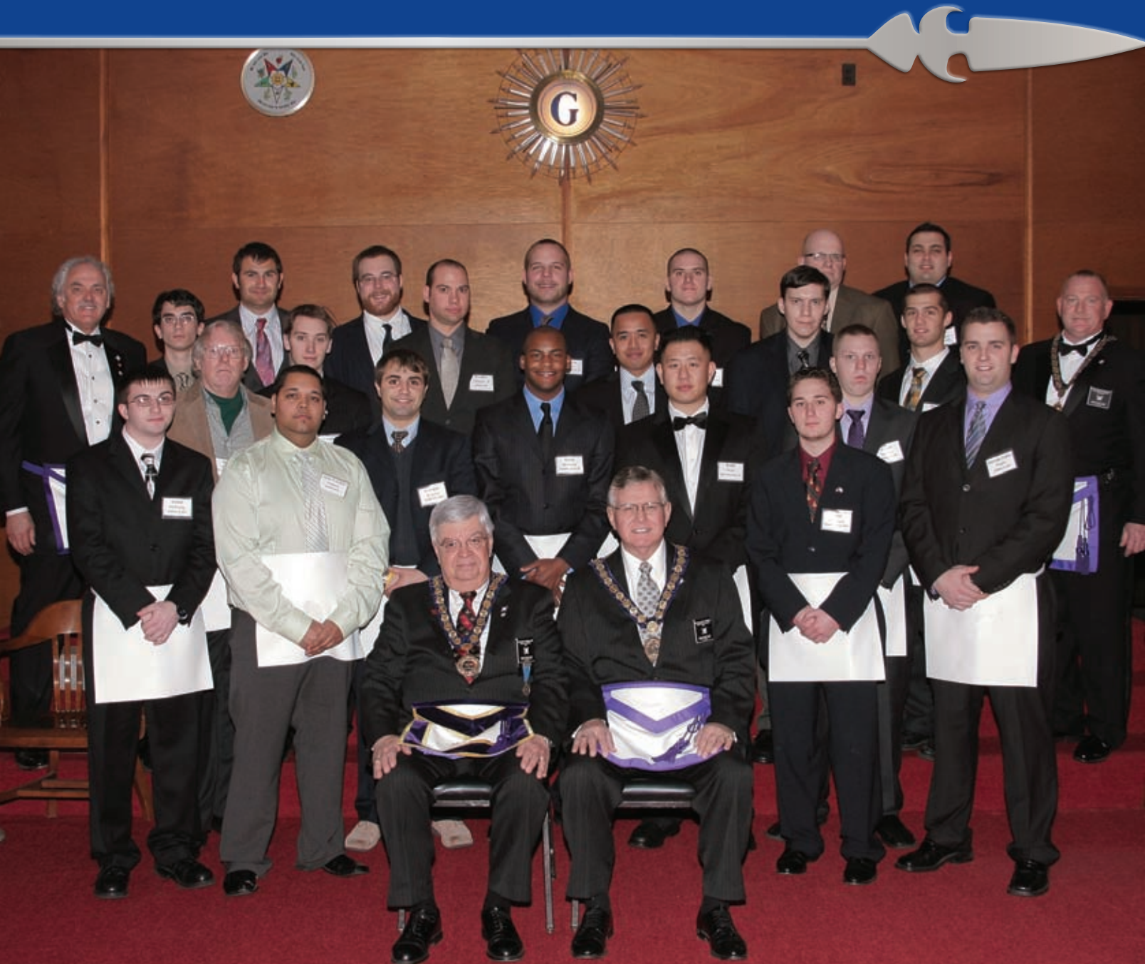
Collegiate One Day Class Participants - See article on page 2