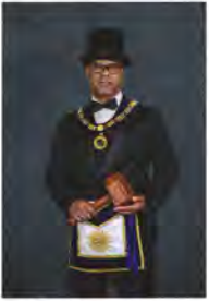
an Open Reception in Honor of