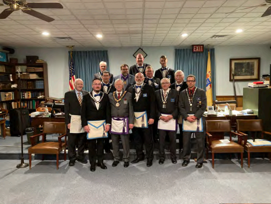
Central Lodge #44