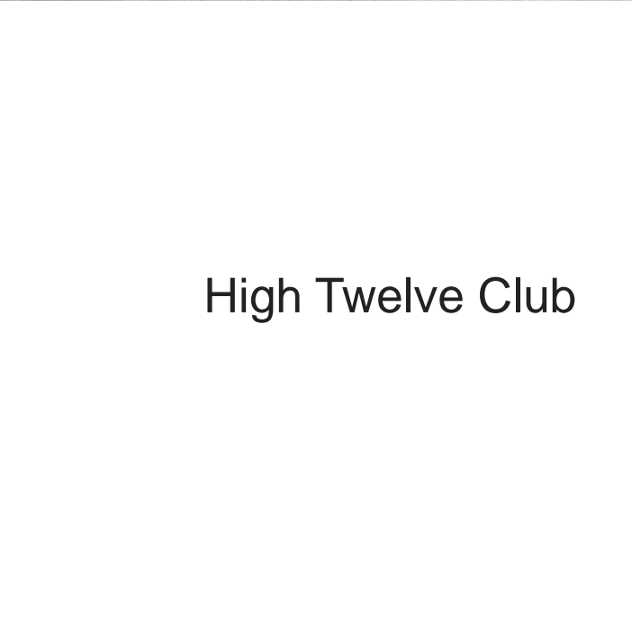
High Twelve Club