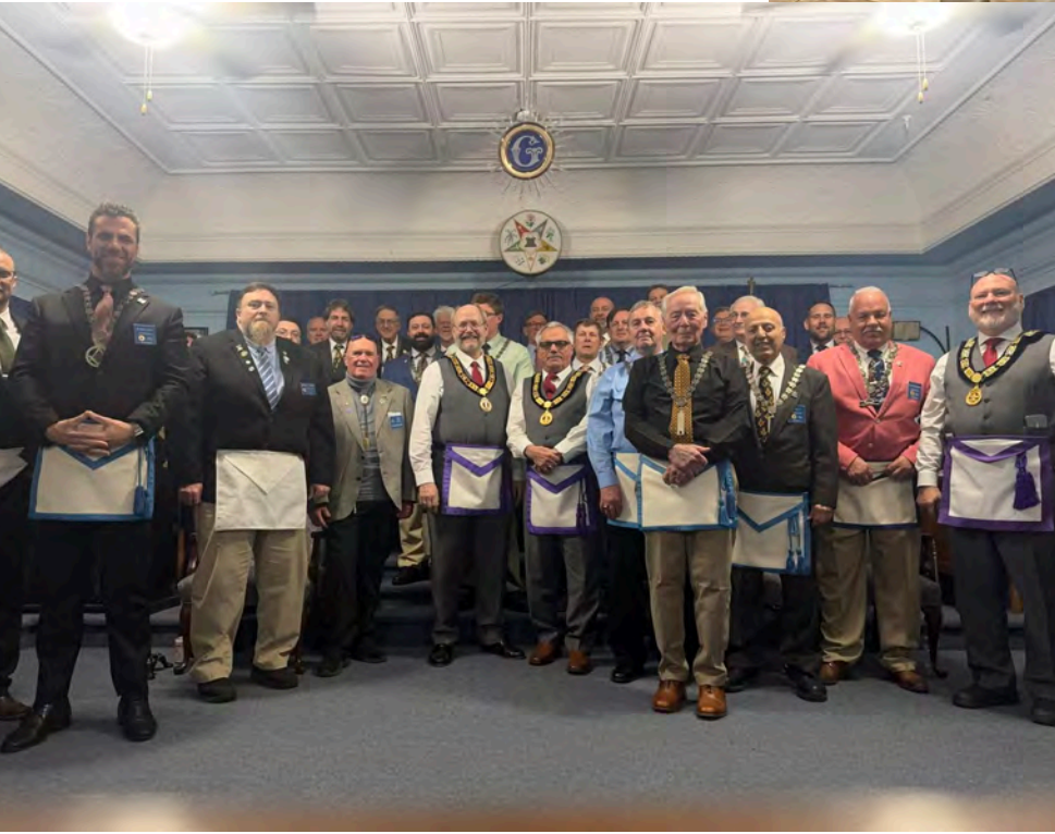
Protocol Lecture - Tuckerton Lodge #4